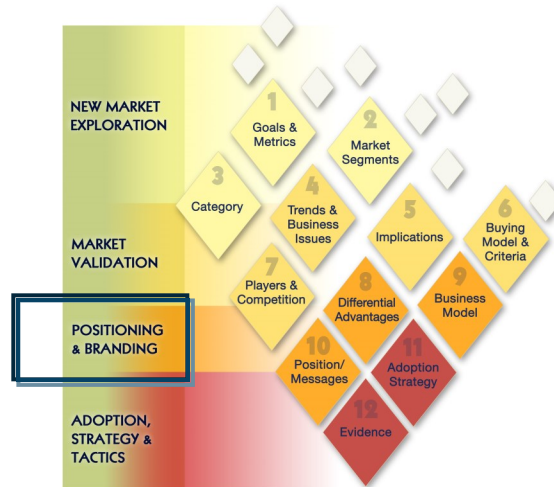
Innovation Process Marketing, IPM®

The IPM Positioning & Branding process for companies and innovation recognizes that addressing important unmet needs and providing customers with differential advantages in their markets is critical to building brand equity. If done correctly the market will embrace the